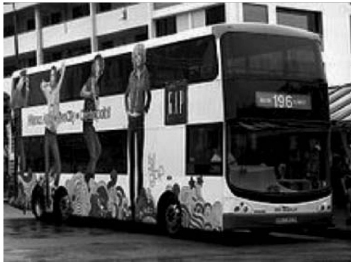
Fig. 1.2 Advertisement on Bus