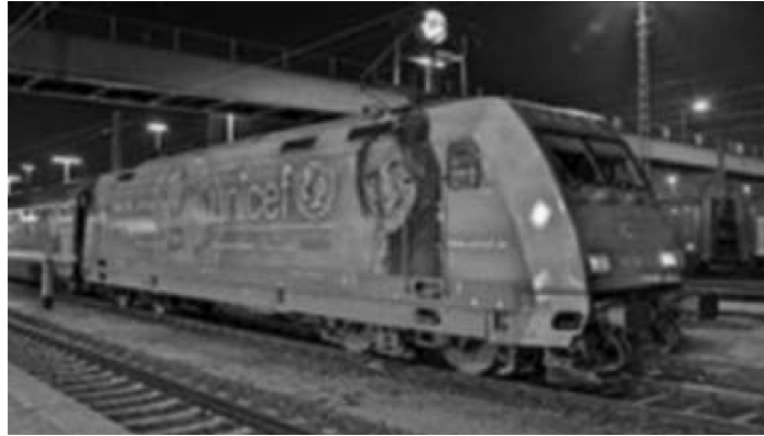
Fig. 1.1 Advertisement on Metro

There are different media that can be used for advertising. It is not rare to find advertisements on billboards, walls, web banners, shopping carts, web pop-ups, bus stop benches, logo-jets (advertisements on the sides of aeroplanes), taxi doors and even in airbuses on the seat-back tray tables and overhead storage bins. These days we even find advertisements on fruits. It is not rare to find advertising stickers on apples when we go to a supermart to purchase them. There are even advertisements on the back of movie tickets and supermarket receipt bills. Advertisements may seem interesting and entertaining at times and annoying at other time. Figure 1.1 shows a metro with a UNICEF advertisement at a railway station. Buses and trains are popular medium of advertising. A bus with an advertisement is a common site not only in India but abroad as well as shown in Figure 1.2.